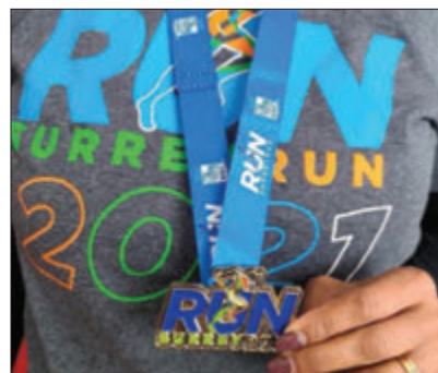
Medal from the virtual Run Surrey Run in 2021.

"Our vision was, and still is, to create a signature event to attract people to Surrey and promote health and